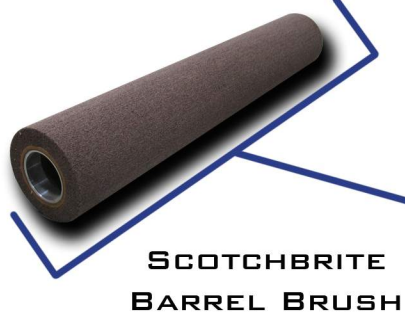
SCOTCHBRITE BARREL BRUSH