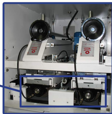
COUNTER ROTATING BRUSHES