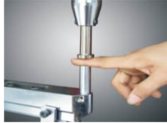
Hand pressing prevent system