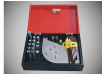
Manual tool kit